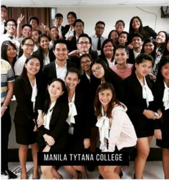
MANILA TYTANA COLLEGE