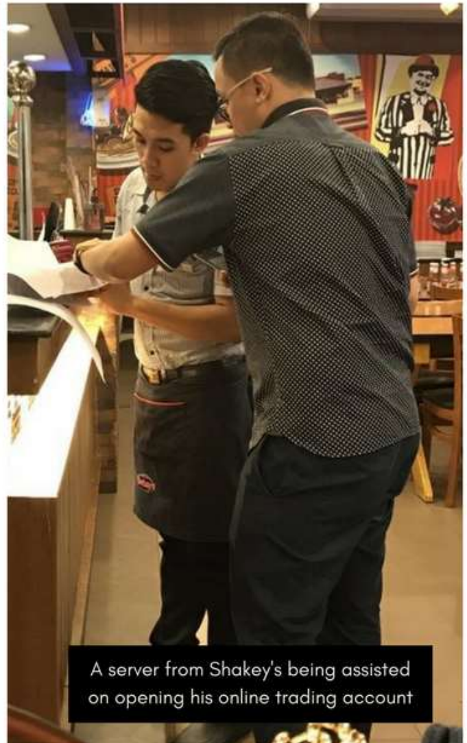
A server from Shakey's being assisted on opening his online trading account

Attendees were able to see the many features of FundsMart, including being able to analyze, screen, and compare over 25-peso denominated funds available on the platform. As soon as the talks ended, dinner, refreshments, and discussions on the stock market filled the room as attendees simultaneously ate and opened their online trading accounts with First Metro Securities.